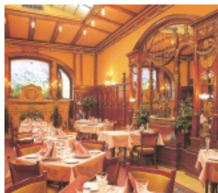
Informal exchange of experiences

On Thursday evening we invite you to join us for a dinner in the Old Town centre of Prague. While enjoying the famous Czech hospitality there will be plenty of opportunity for conversation and exchange of experiences.