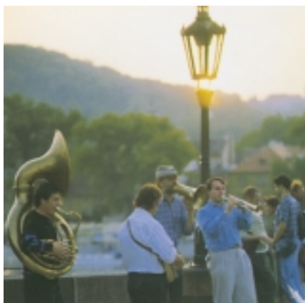
Celebrating Prague Spring